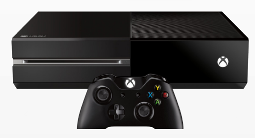
Enter Your Email for a chance to win