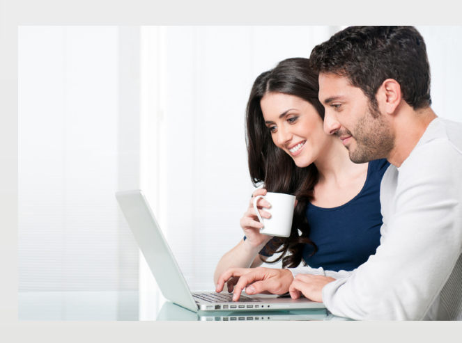
One (1) Prize Winner will be selected on or about March 6, 2014 by a random drawing from all qualified entries received by a participating credit union between January 1, 2014 and February 28, 2014. Eligible members can enter the contest by entering their email address in It's Me 247 online banking. No purchase necessary. See your credit union for complete details, including contest rules, restrictions and alternate method of entry. Void where prohibited by law. Terms and Conditions may apply.

Submit your email address to a participating credit union staff member for entry.